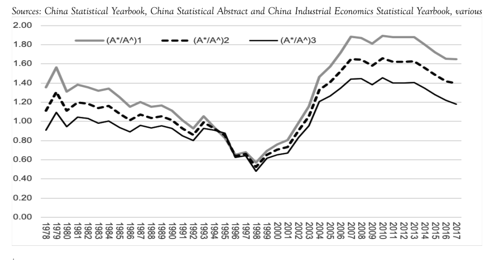
Figure 2. TFP Levels of Industry: SOEs Relative to Non-SOEs

Fortune Global 500 biggest firms in 2018, mainland China had 115, of which ninety were identifiably SOEs (which accounted for 84% of the sales revenue of the 115 firms). This number of Chinese firms in the Fortune Global 500 was very close to that of the United States, and that of the European Union.<sup>14</sup>